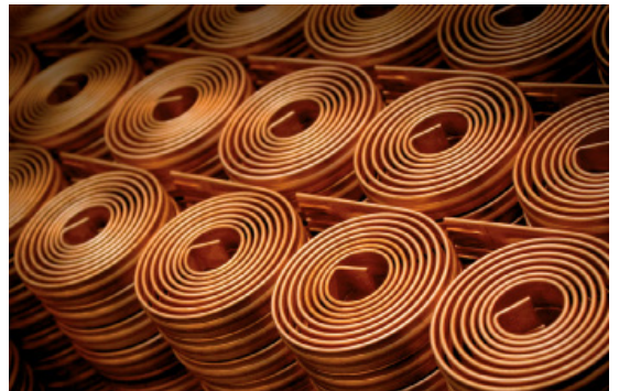
The Bourdon spring